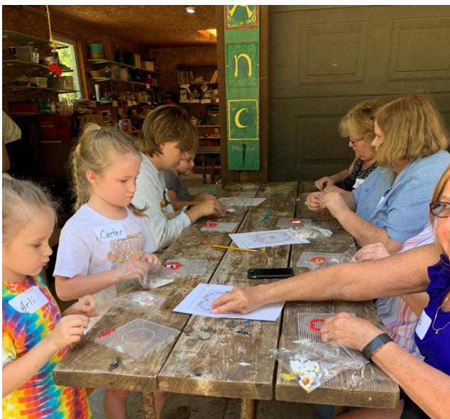
Arts & Crafts at "A Summer Day at Camp"

The best way to contact her is by texting her cell phone at 608-865-1074 or emailing her at cathleenmorris@go.mccormick.edu .